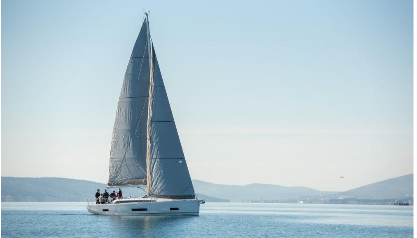
SALONA 46

Croatia's Salona Yachts has presented in Split its new and unique luxury yacht in the world, the SALONA 46.